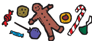
candy donations needed

Ziploc baggies (snack, sandwich & gallon)