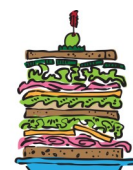
Lunch With the Pastor